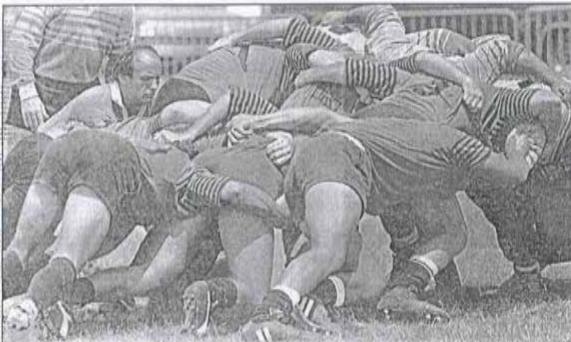
Rugby players engage in an unusual practice known as a scrum, in which the ball is entered into play, during a tournament Saturday at Battleship Park.