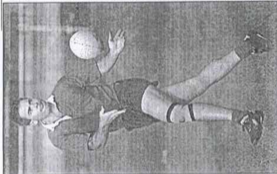
Battleship Club member works out for weekend series.

Sunday's consolation game will be at 11 a.m. with the national final at 1 p.m. Admission is free.