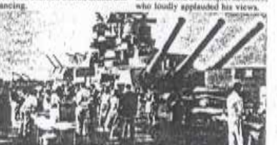
The tournament banquet was hosted on the fanfare of the U.S.S. Alabama, Mobile's major tourist attraction. In addition to winning, the Battleship RFC did a fine job in organizing and hosting this event.

Custom Made Embroidered Enamel EMBLEMS PINS