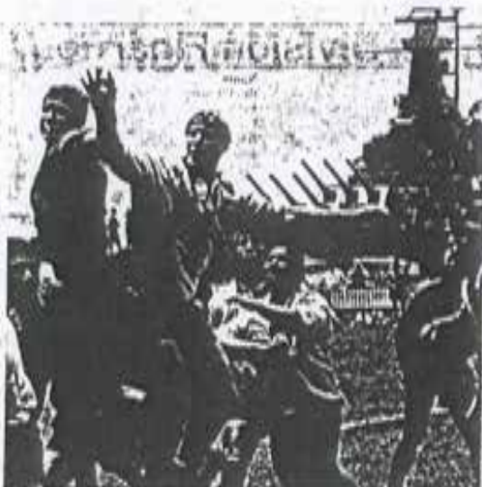
Nashville (right), the Midwest champ, contests a lineout vs. Santa Rosa, the Pacific champ, in the semifinals. Nashville came from behind to win 9-8 on a late try and sideline conversion, while Battleship, the East champ, handled Bay Area, the West champ, 23-3 in the other.